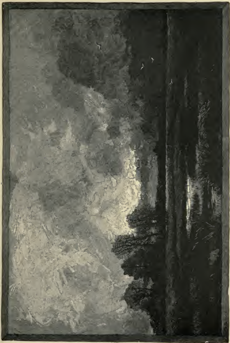
"SPRING IN NEW ENGLAND." Page 206.